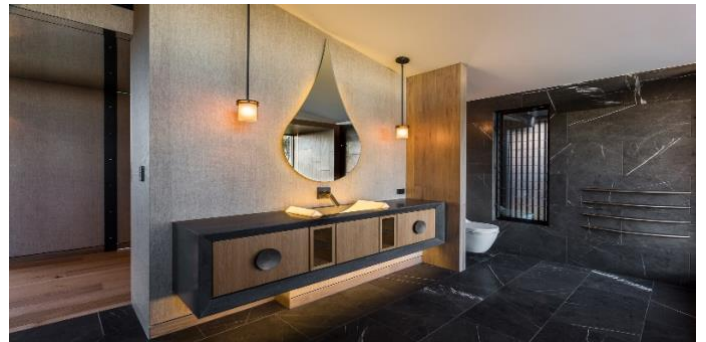
Corian® Lava Rock used in shower wall, kitchenette benchtop and splashbackl + vanity benchtop and drawer fronts.

Along with its silky seamless finish, Corian® Lava Rock Shower walls blended perfectly into the material mix and allowed the desired design results to be achieved. Cool in its sophistication and calm in its appeal Corian® Shower Walls are warm and sensual to the touch and with no grout. It's very easy to clean, and to maintain high level of hygiene over years, making it perfect for this hotel environment. With superior sensory qualities and customizable designs, Corian® Shower Walls is meeting a wide variety of demands in terms of both style and function as required by interior designer, Mark Gacesa.