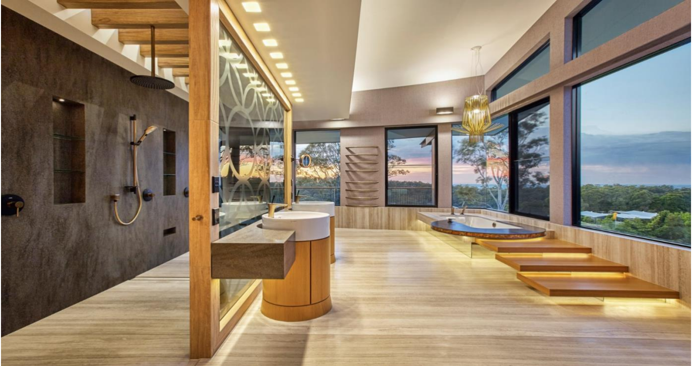
Corian® Lava Rock used in shower wall and vanity benchtop and drawer fronts.

This project has the presence of a 7-star luxury hotel while at the same time mixes the warmth and organic feel of nature. It swept the Queensland HIA Bathroom and Kitchen Awards, but there is something you might not know about the beautiful Luxe Lodge – Corian® Solid Surface is featured extensively.