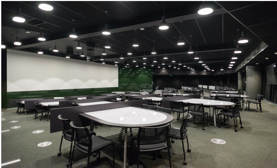
Corian® uniquely thermoformed into 3-D Curved Forms