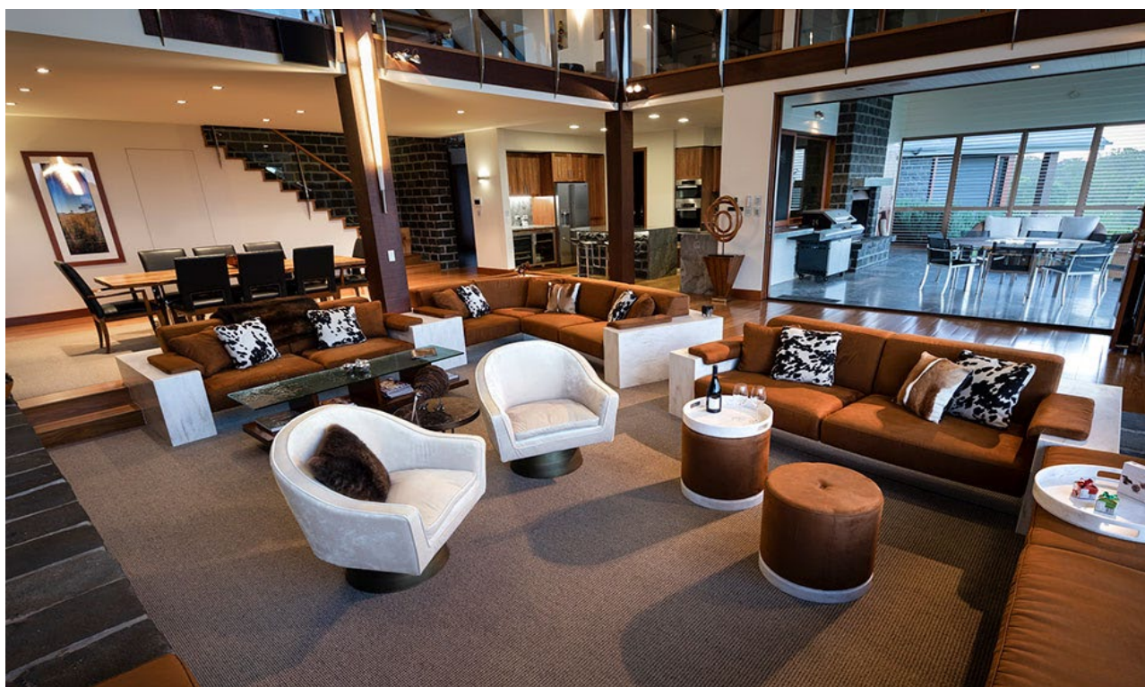
Corian® Solid Surface backlit and underlighting has also been installed to the fronts of the upholstered seating. Design by Mark Gacesa of Ultraspace, photo by Scott Shirley. All rights reserved.

The built-in sofa arms have been design to be extra wide for a dramatic effect and used as side tables. The arms flow around the tan suede upholstery to become the back of the sofa to create a solid enclosure or framing for the upholstery.