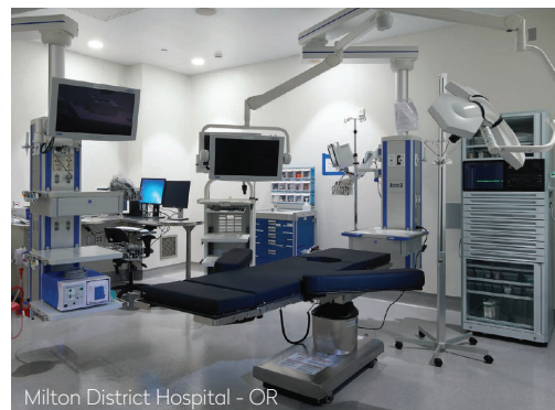
Milton District Hospital - OR

Corian® Sinks – Approx. 63 Sinks ( Various Models )