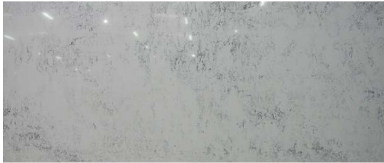
Okite Collection (veining effect)