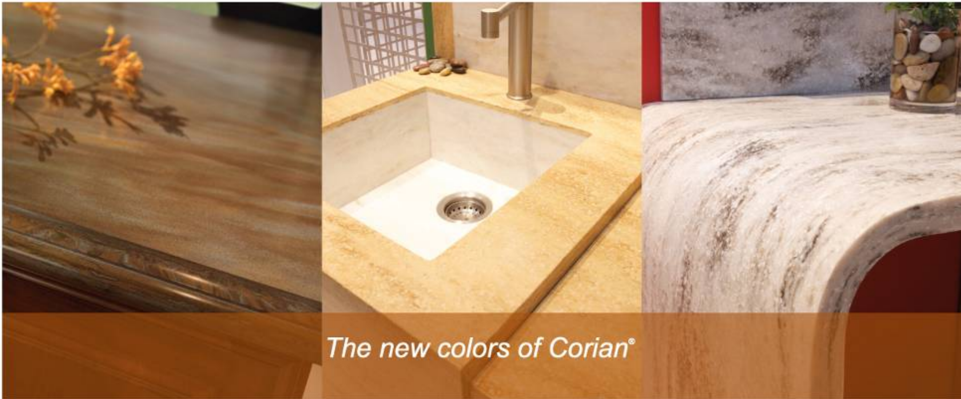
The new colors of Corian®